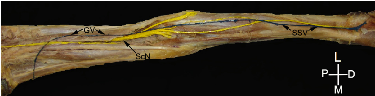
Figure 1: The posterior aspect of the right lower limb has been dissected, demonstrating the small saphenous vein (SSV) not terminating into the popliteal vein, but into the large saphenous vein as Giacomini vein (GV).

Schweighofer et al classified the following five types of saphenopopliteal junction (SJ): a) Large and distinct SJ with thin SSV's thigh extension (37.2%). b) Thin SJ with large SSV thigh extension (15.1%). c) Absence of SJ with prominent SSV thigh extension (24.4%). d) Doubled SJ with evident SSV thigh extension (5.8%). e) Web style SJ with distinct SSV thigh extension (17.4%) 5 . Kosinski observed the following types: Type 1a (42%), with exclusive termination into the SSV. Type 1b (15.3%) where