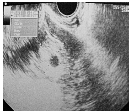
Figure 2: Ultrasound image of right tubal pregnancy.