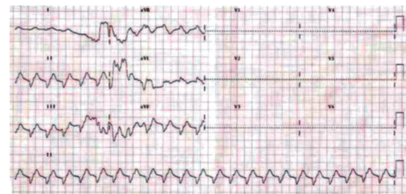
Figure 1: Ventricular tachycardia when syncope was developed.

Defibrillation was performed and normal sinus rhythm was obtained. Physical examination showed an incision scar belonging to the operation. Electrolyte imbalance and hypoxia were not detected and his blood count was normal. Ejection fraction was evaluated by transthoracic echocardiography and it was 15%. After obtaining written consent, coronary angiography was performed in same day. A few plaques but not total occlusion or vasospasm were detected (Figure 2,3). In following days ventricular tachycardia, pulseless ventricular tachycardia and ventricular