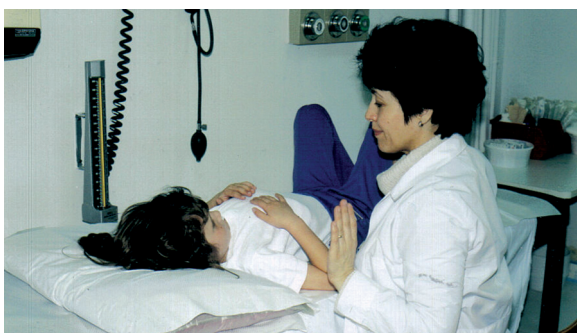
Figure 2. Application of pressure and vibration from the child

The active cycle of breathing techniques (ACBT) was performed in drainage positions and contained: diaphragmatic breathing (5–10 times), thoracic breathing (4 times deep breathing + 5 sec hold of breath), percussion, pressure-vibration, forced expiration technique or huffing, cough and active respiratory exercises (unilateral and bilateral, durated 10 min). The treatment was active applied by the patients themselves under our control. The duration of the application of ACBT in all positions was 45 min. The total duration of therapy session was 55min.